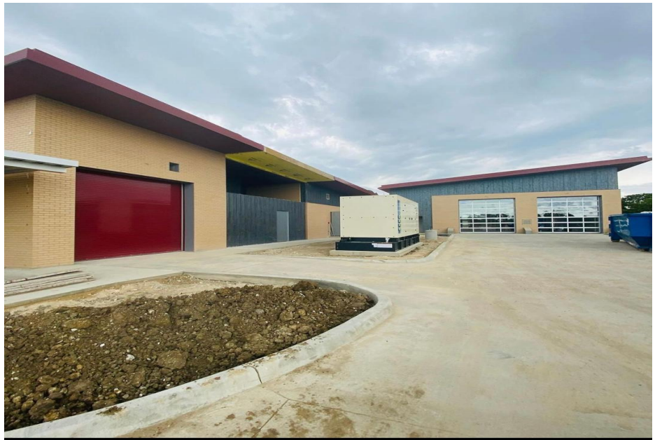
New Public Safety Building which will house an Engine and an Ambulance.